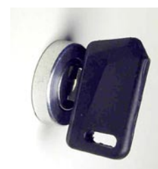
Key Switch System