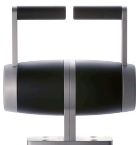
Dual top mounted throttles for twin engine applications