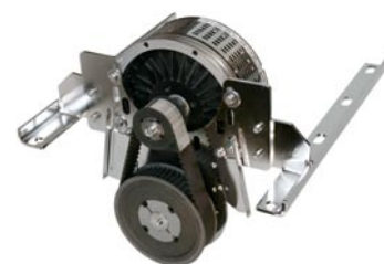
Motor, included console, with reduction and mounting brackets